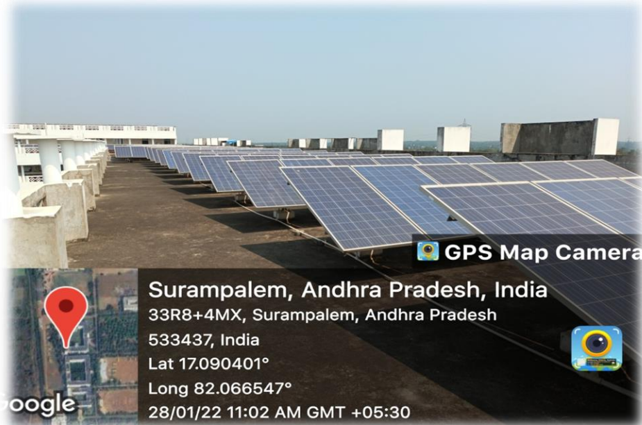
Solar Panel on roof top of Ramanujan Bhavan