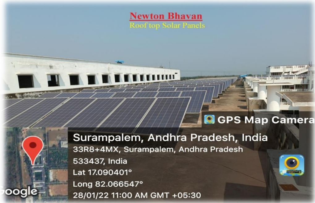
Solar Panel on roof top of Newton Bhavan

Aditya Nagar, ADB Road, Surampalem - 533 437, E.G.Dist., Ph: 99631 76662.