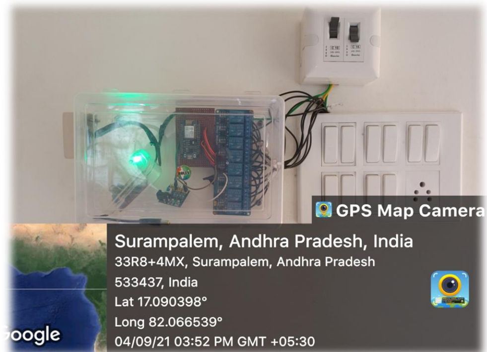
Sensor based equipment installed in Ramanujan bhavan