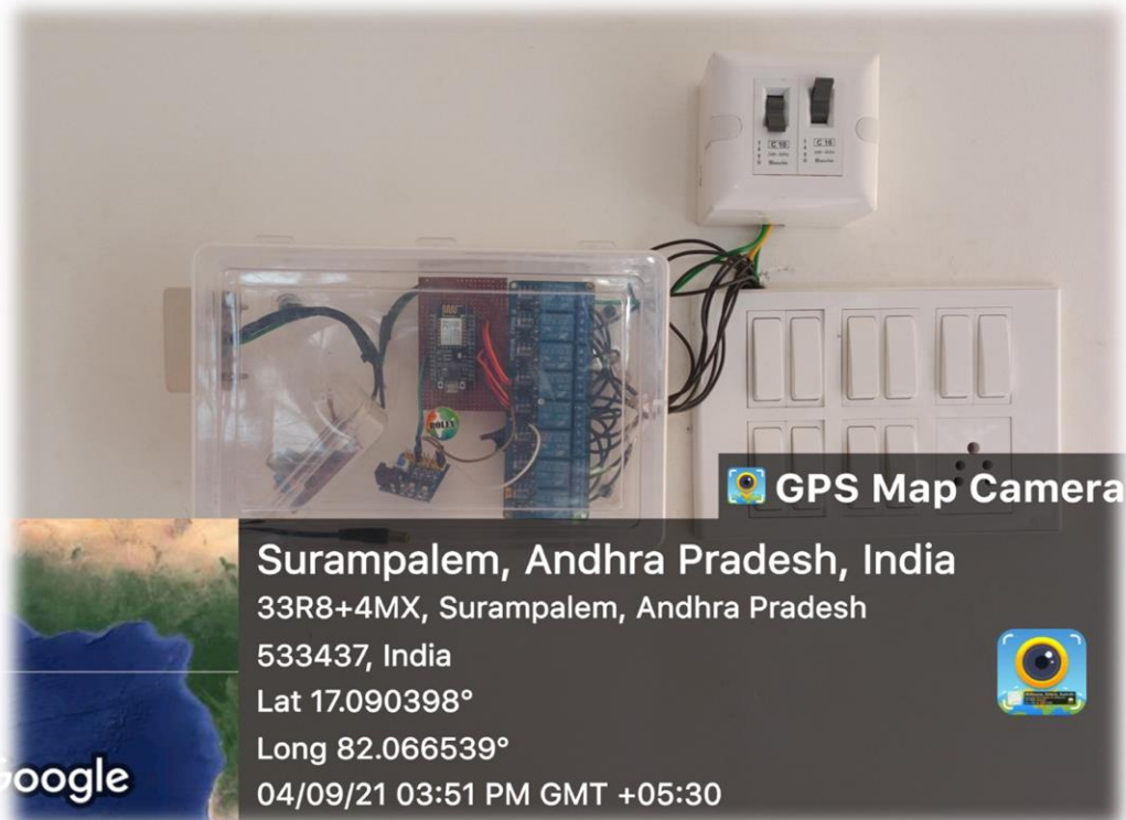
Sensor based equipment installed in Ramanujan bhavan

Aditya Nagar, ADB Road, Surampalem - 533 437, E.G.Dist., Ph: 99631 76662.