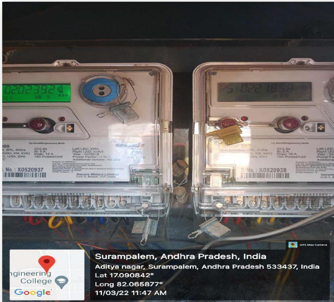
Wheeling to The Grid -Meter Placed On Top Of Ramanujan Bhavan

The Wheeling to the Grid installed on roof top of each building where solar panels are installed at Aditya college of Engineering. The institution is wheeling the power generated from the rooftop solar panels to the distribution grid. The units shared with grid are reduced from the actual consumption.