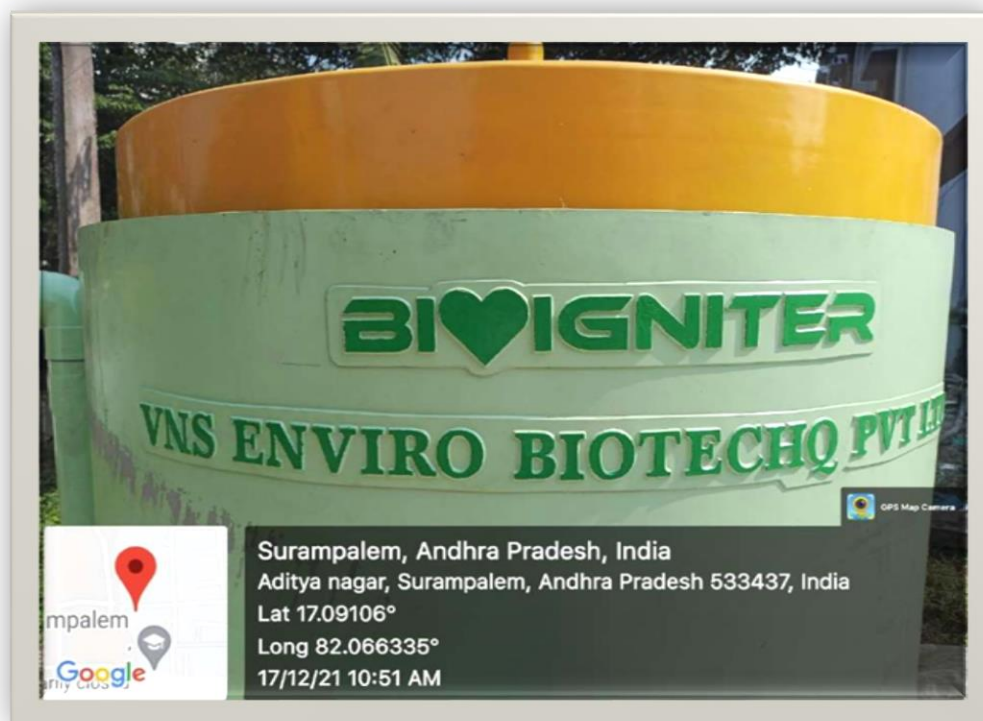
BIOGAS PLANT AT RAMANUJAN BHAVAN CANTEEN