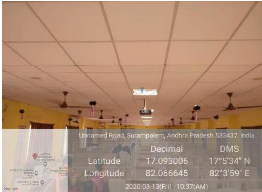
LED bulbs in Seminar Hall

Aditya Nagar, ADB Road, Surampalem - 533 437, E.G.Dist., Ph: 99631 76662.