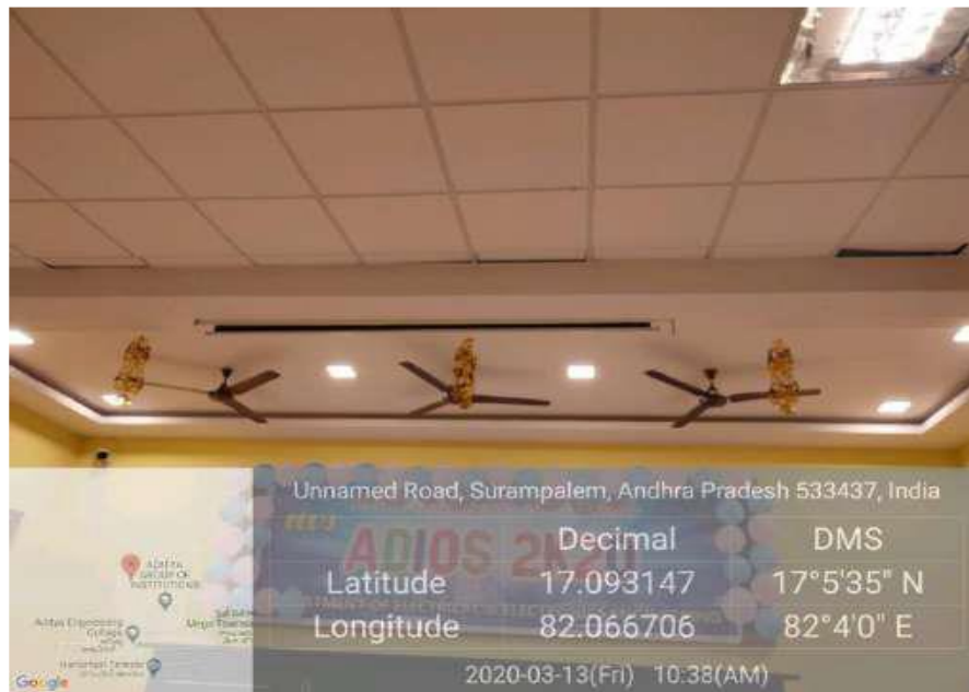
LED bulbs in Seminar Hall