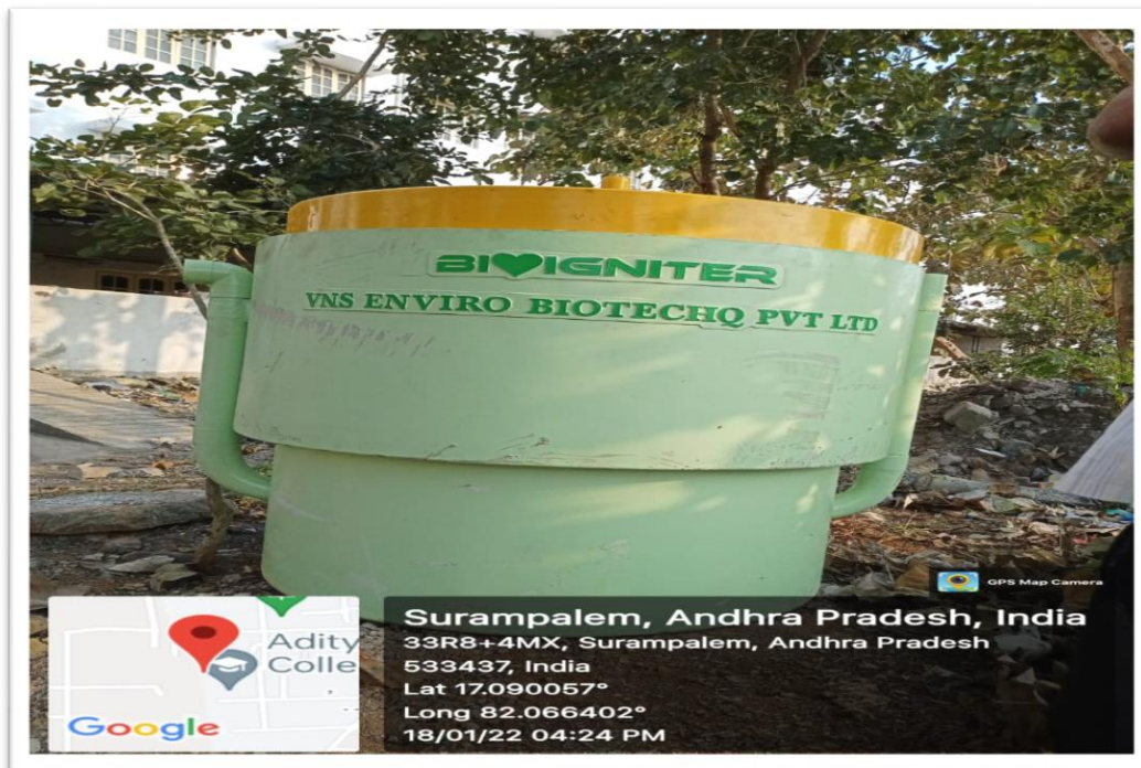
BIOGAS PLANT AT RAMANUJAN BHAVAN CANTEEN

Aditya Nagar, ADB Road, Surampalem - 533 437, E.G.Dist., Ph: 99631 76662.