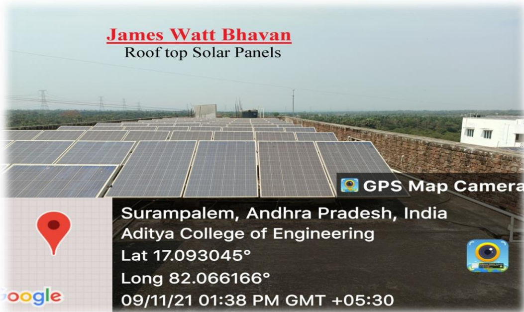
Solar Panel on roof top of James Watt Bhavan