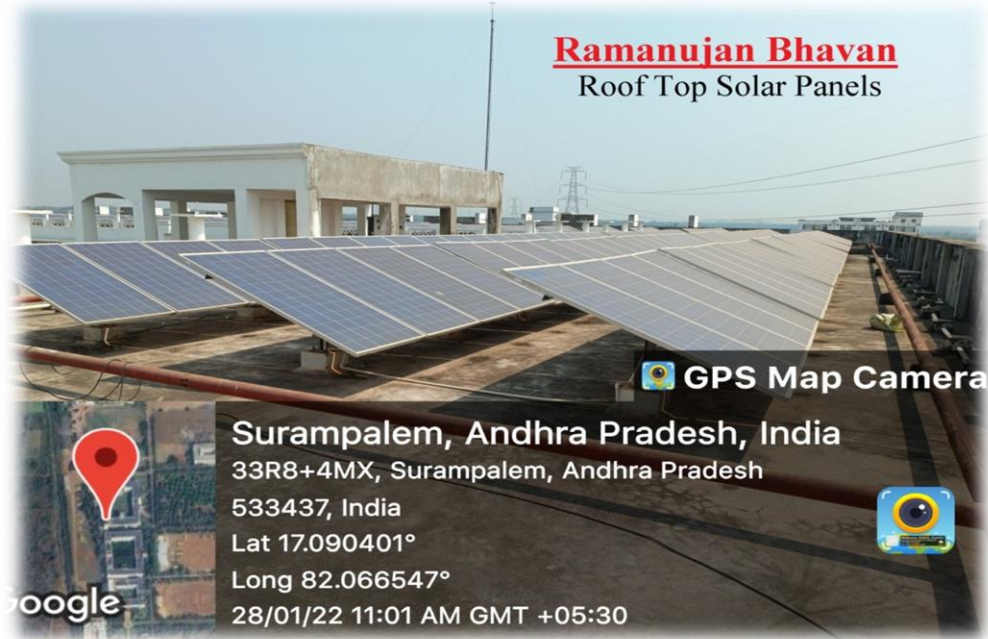
Solar Panel on roof top of Ramanujan Bhavan

Aditya Nagar, ADB Road, Surampalem - 533 437, E.G.Dist., Ph: 99631 76662.